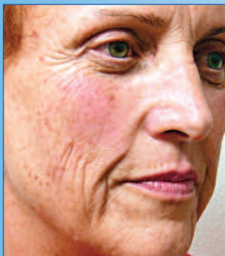
Before Tx