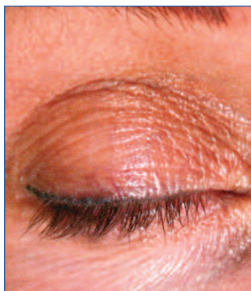
Before Tx

"Of course patients want less risk, less pain, less downtime, plus efficacy and the industry is responding. It's rapidly becoming a walk in, walk out, look good, tell your friends business."